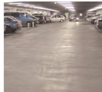
Densit® SkimCoat in parking areas.

If using a special Densit Mixer Pump unit it is possible to cover large areas in short time.