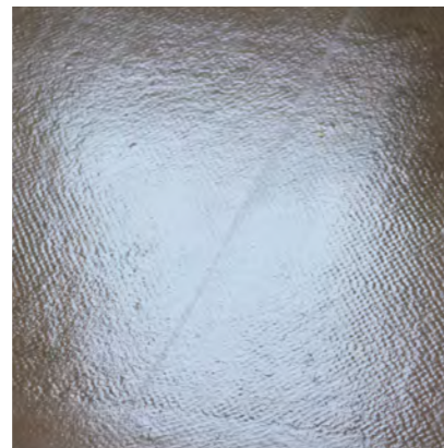
Densit® SkimCoat surface polished with HTC Sealer.