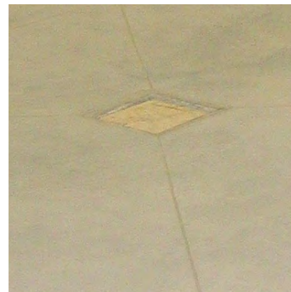
Surface of Densit® SkimCoat